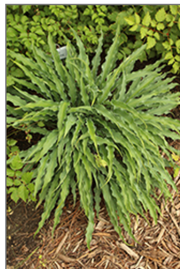
Silly String Hosta

Silly String Hosta is recommended for the following landscape applications;