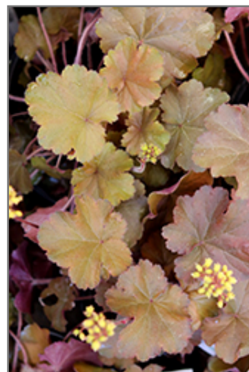
Sirens' Song Orange Delight Coral Bells foliage