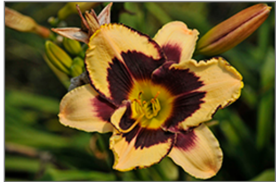
Inkheart Daylily flowers