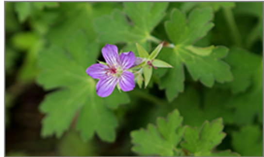
Lakwijk Star Siberian Cranesbill flowers