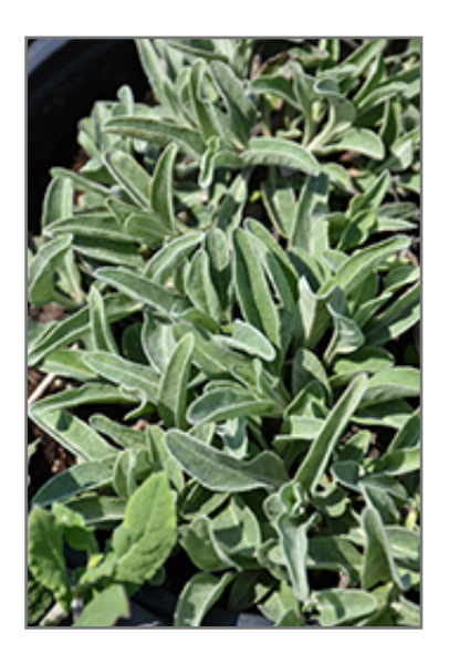
Silver Speedwell foliage