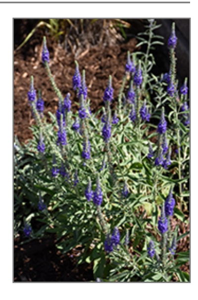
Silver Speedwell flowers

This plant does best in full sun to partial shade. It is very adaptable to both dry and moist growing conditions, but will not tolerate any standing water. It is considered to be drought-tolerant, and thus makes an ideal choice for a low-water garden or xeriscape application. This plant should not require much in the way of fertilizing once established, although it may appreciate a shot of general-purpose fertilizer from time to time early in the growing season. It is not particular as to soil type or pH. It is highly tolerant of urban pollution and will even thrive in inner city environments. This species is not originally from North America. It can be propagated by division.