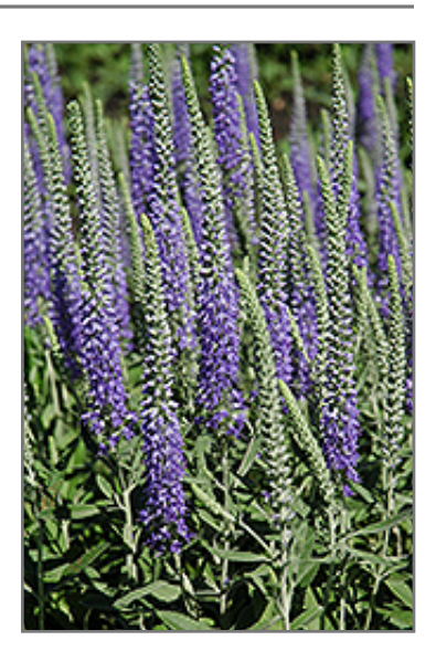
Silver Speedwell flowers