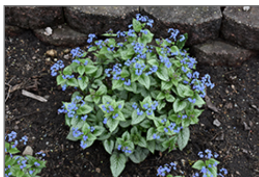
Sterling Silver Bugloss in bloom