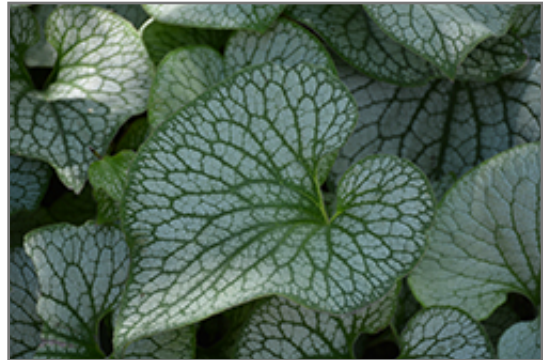
Sterling Silver Bugloss foliage

Sterling Silver Bugloss will grow to be about 12 inches tall at maturity, with a spread of 24 inches. When grown in masses or used as a bedding plant, individual plants should be spaced approximately 20 inches apart. It grows at a medium rate, and under ideal conditions can be expected to live for approximately 10 years. As an herbaceous perennial, this plant will usually die back to the crown each winter, and will regrow from the base each spring. Be careful not to disturb the crown in late winter when it may not be readily seen!