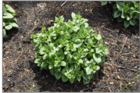
Jack of Diamonds Bugloss

Jack of Diamonds Bugloss will grow to be about 14 inches tall at maturity, with a spread of 30 inches. When grown in masses or used as a bedding plant, individual plants should be spaced approximately 28 inches apart. It grows at a medium rate, and under ideal conditions can be expected to live for approximately 10 years. As an herbaceous perennial, this plant will usually die back to the crown each winter, and will regrow from the base each spring. Be careful not to disturb the crown in late winter when it may not be readily seen!