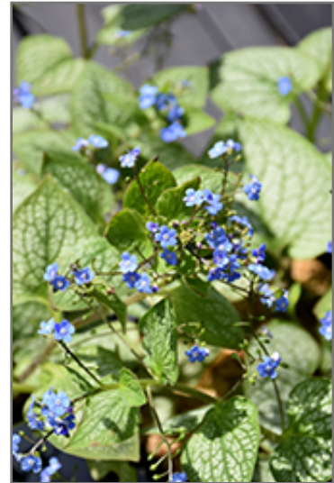
Jack of Diamonds Bugloss flowers