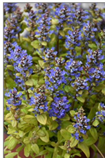
Feathered Friends Fancy Finch Bugleweed flowers

Feathered Friends Fancy Finch Bugleweed is recommended for the following landscape applications;