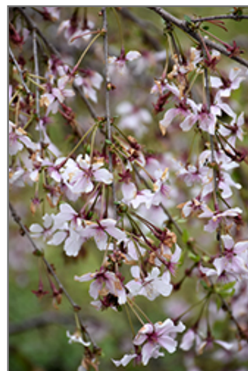
Weeping Fuji Cherry flowers

Weeping Fuji Cherry is recommended for the following landscape applications;