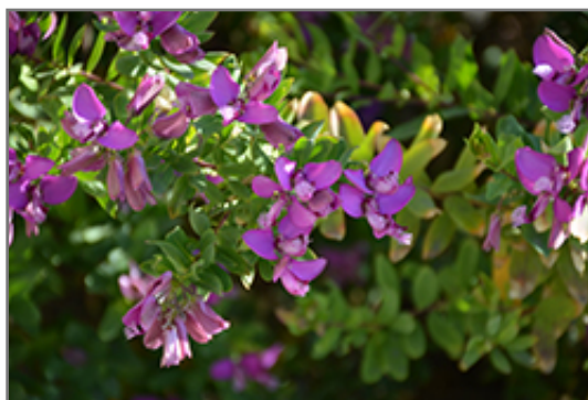
Grandiflora Sweet Pea Shrub flowers