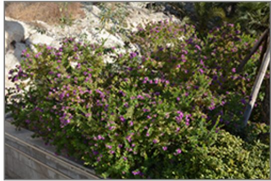
Grandiflora Sweet Pea Shrub in bloom

This plant is not reliably hardy in our region, and certain restrictions may apply; contact the store for more information.