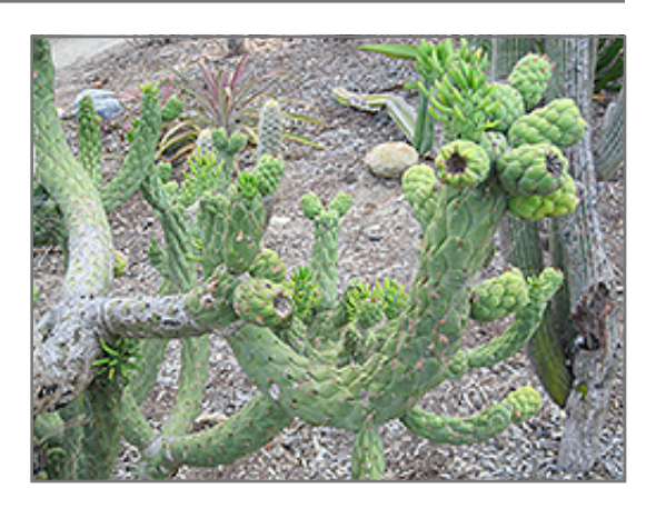
Cane Cactus foliage

Cane Cactus is a member of the cactus family, which are grown primarily for their characteristic shapes, their interesting features and textures, and their high tolerance for hot, dry growing environments. As an 'opuntiad' type of cactus, it doesn't actually have leaves, but rather modified succulent stems that comprise the bulk of the plant, and which are designed to retain water for long periods of time. This particular cactus is valued for its upright and spreading habit of growth on a plant consisting of long, narrow spiny grayish green segmented stems that form 'branches' which spread out from a central base. This plant features showy red cup-shaped flowers at the ends of the branches in early summer. It produces chartreuse berries from early to mid fall.