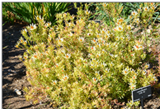
Little Bit Conebush

This plant is not reliably hardy in our region, and certain restrictions may apply; contact the store for more information.