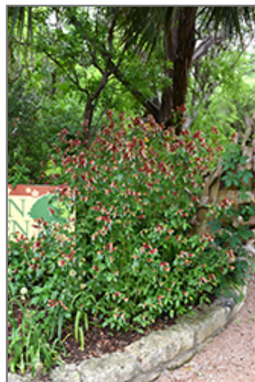
Fruit Cocktail Shrimp Plant in bloom