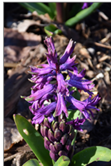
Purple Sensation Hyacinth flowers