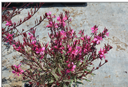
Gambit Variegata Rose Gaura in bloom