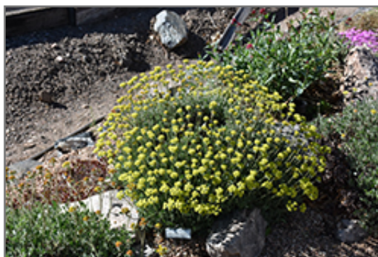
Kannah Creek Sulphur Flower Buckwheat in bloom

Kannah Creek Sulphur Flower Buckwheat is recommended for the following landscape applications;