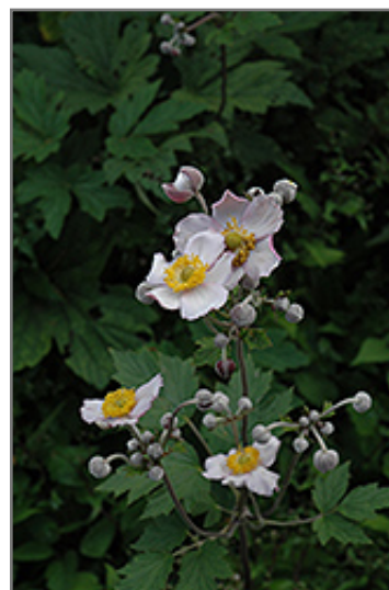
Grapeleaf Anemone flowers