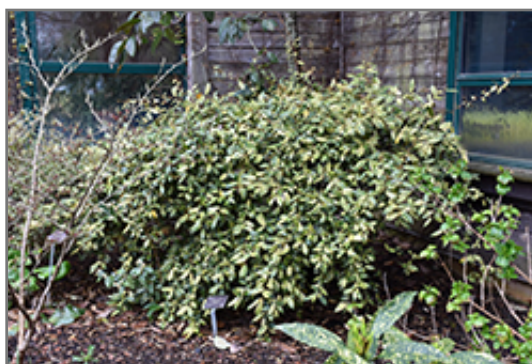
Chirifu Variegated Silverberry