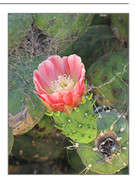
Eve's Needle Cactus flowers

This shrub will require occasional maintenance and upkeep, and usually looks its best without pruning, although it will tolerate pruning. Stray segments or shoots can be carefully removed or thinned to control the overall form and spread of the plant. Deer don't particularly care for this plant and will usually leave it alone in favor of tastier treats. Gardeners should be aware of the following characteristic(s) that may warrant special consideration;