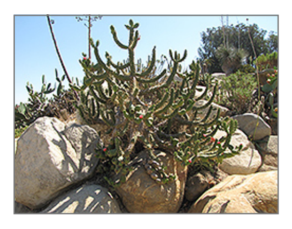
Eve's Needle Cactus