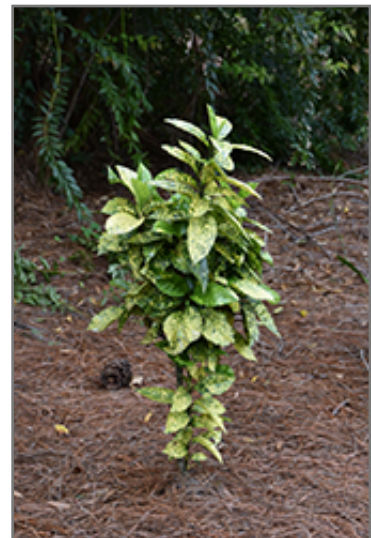
Marmorata Aucuba