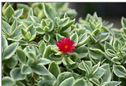
Variegated Baby Sun Rose flowers