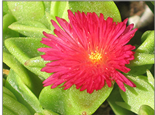
Red Apple Baby Sun Rose flowers