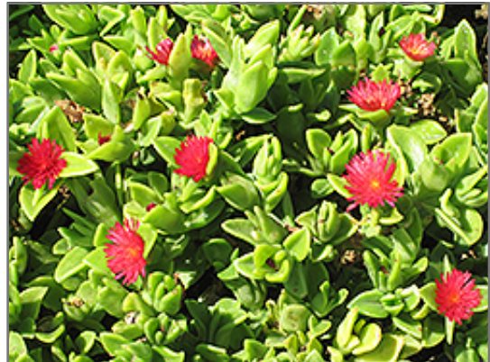
Red Apple Baby Sun Rose in bloom