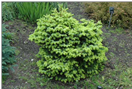
Hunnewell Nordmann Fir