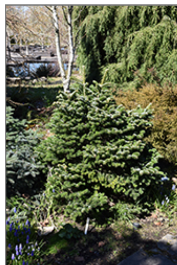
Hunnewell Nordmann Fir