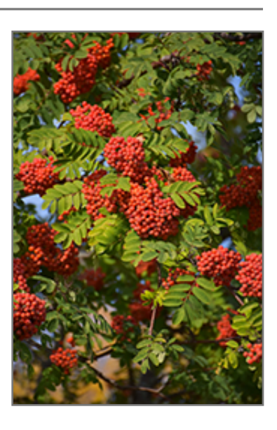
Edulis Mountain Ash fruit