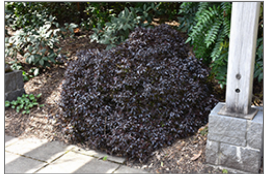
Tom Thumb Kohuhu