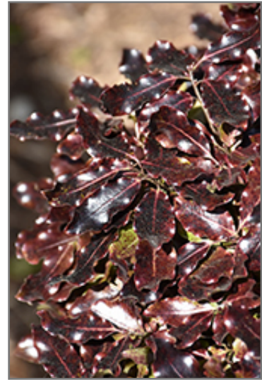
Tom Thumb Kohuhu foliage

This plant is not reliably hardy in our region, and certain restrictions may apply; contact the store for more information.