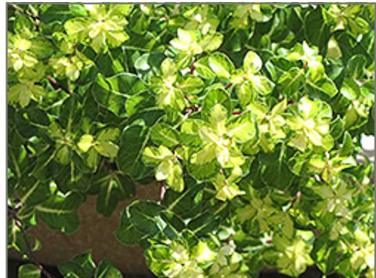
Gold Star Kohuhu foliage

Gold Star Kohuhu is recommended for the following landscape applications;