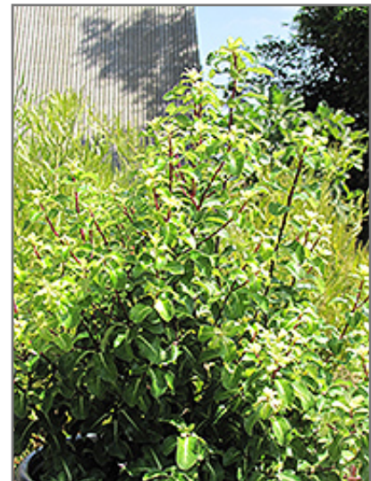
Gold Star Kohuhu