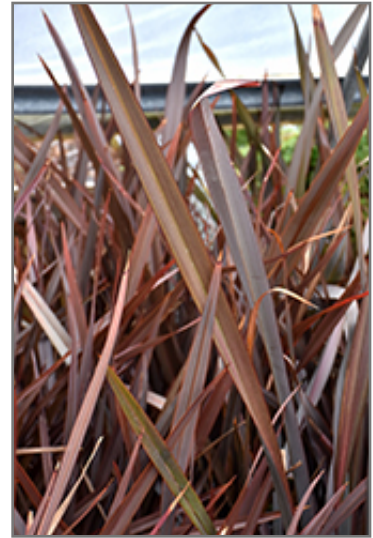
Special Red New Zealand Flax foliage