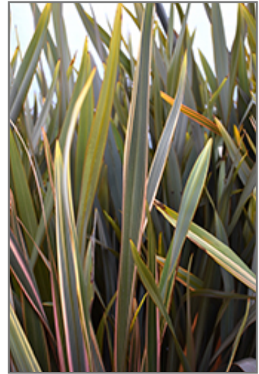
Rosie Chameleon New Zealand Flax foliage