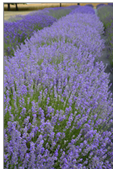
W.K. Doyle Lavender in bloom