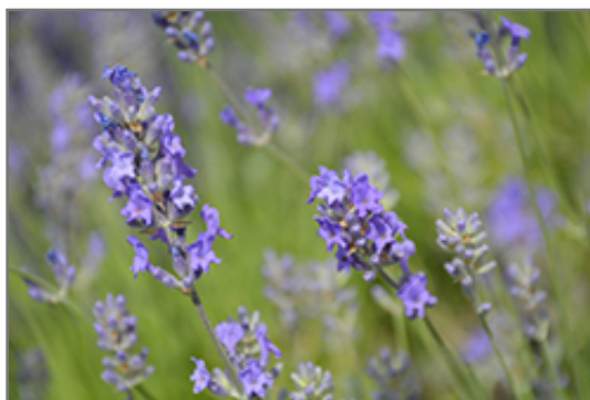
Sachet Lavender flowers