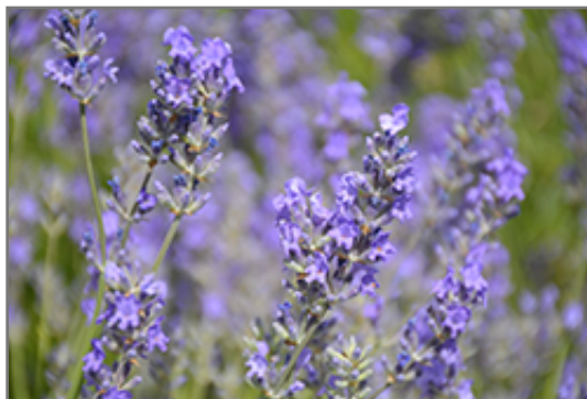
Sachet Lavender flowers

Sachet Lavender is recommended for the following landscape applications;