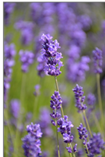
Imperial Gem Lavender flowers