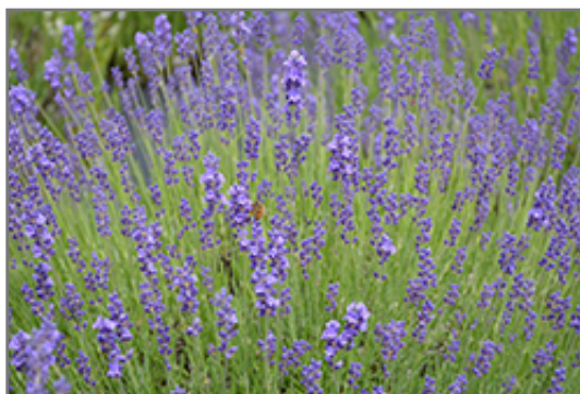
Betty's Blue Lavender flowers