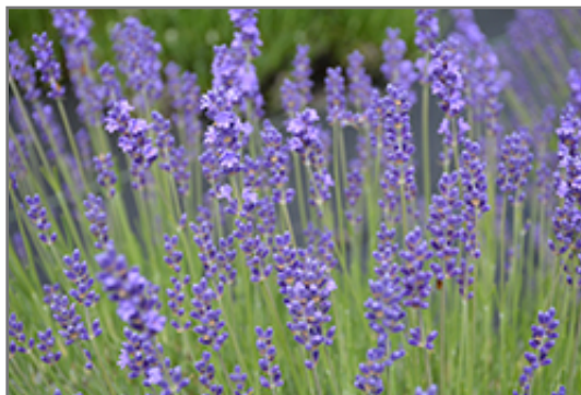
Betty's Blue Lavender flowers

Betty's Blue Lavender is recommended for the following landscape applications;