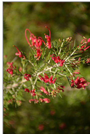
Wilson's Grevillea flowers