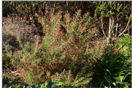
Wilson's Grevillea in bloom

This plant is not reliably hardy in our region, and certain restrictions may apply; contact the store for more information.