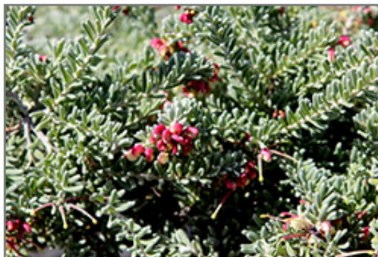
Prostrate Woolly Grevillea flowers