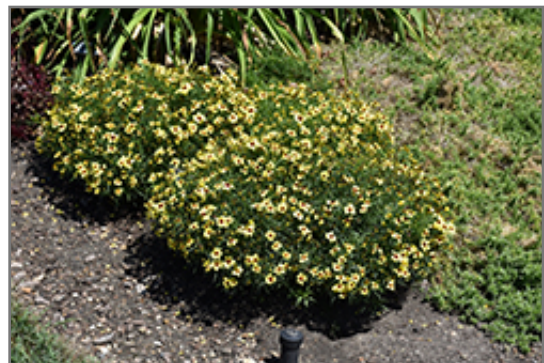
Sizzle And Spice Sassy Saffron Tickseed in bloom