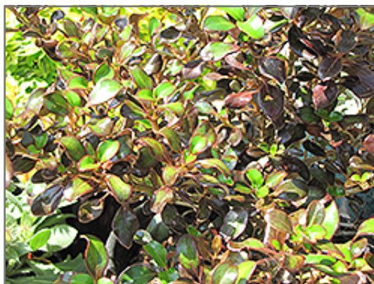
Karo Red Mirror Bush foliage

Glossy, emerald green foliage takes on hues of dark burgundy red as the season progresses into fall and winter; an extraordinary variety, perfect for shaping into topiaries or hedges; visually stunning