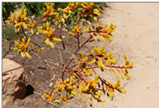
Yellow Gem Kangaroo Paw flowers