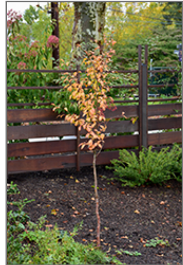
Milk And Honey Japanese Stewartia in fall