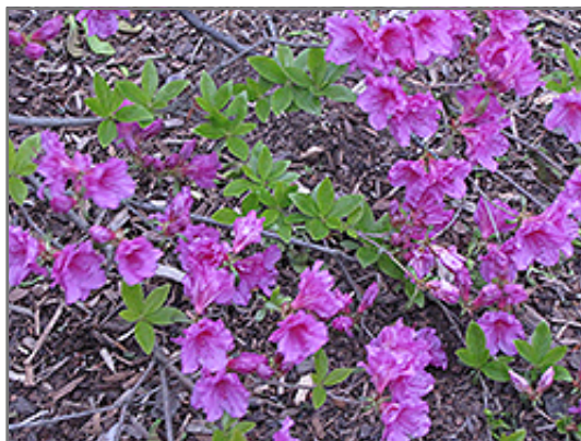
Jessica Azalea in bloom