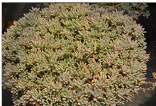
Darley Sunshine Graptosedum