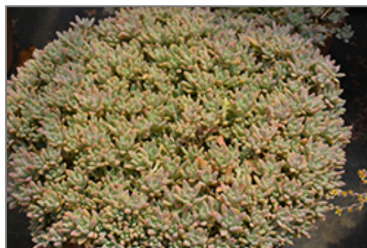
Darley Sunshine Graptosedum