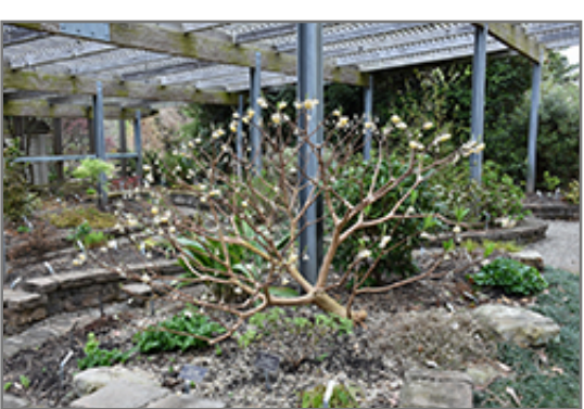
Snow Globe Hybrid Japanese Paper Bush in bloom

Snow Globe Hybrid Japanese Paper Bush is a multi-stemmed deciduous shrub with a mounded form. Its average texture blends into the landscape, but can be balanced by one or two finer or coarser trees or shrubs for an effective composition.