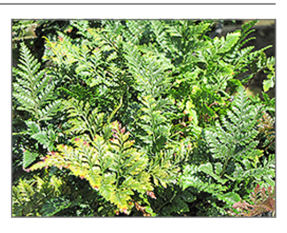
Squirrel's Foot Fern

Elegant, lacy fronds create a lush mound of foliage; develops interesting fuzzy rhizomes that hang over the sides of containers, and must be misted to avoid drying out; a great house or patio plant