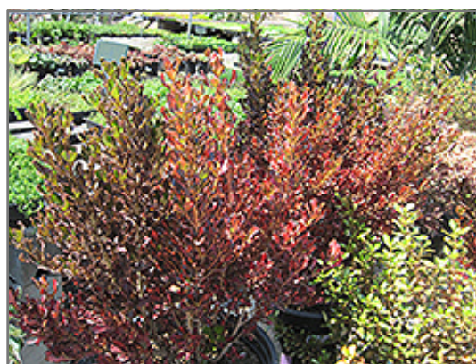
Pacific Sunset Mirror Bush