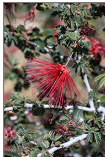
Baja Fairy Duster flowers

Baja Fairy Duster is recommended for the following landscape applications;