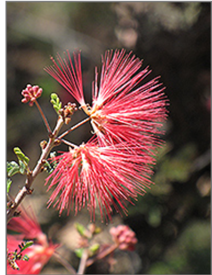
Baja Fairy Duster flowers

This plant is not reliably hardy in our region, and certain restrictions may apply; contact the store for more information.