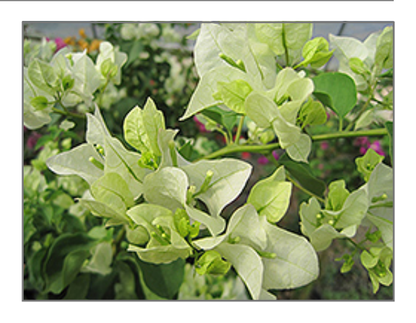
Jamaica White Bougainvillea in bloom

This plant will require occasional maintenance and upkeep, and can be pruned at anytime. It has no significant negative characteristics.