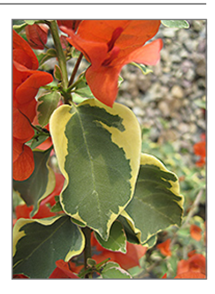
Bambino Baby Sophia Bougainvillea foliage

Bambino Baby Sophia Bougainvillea will grow to be about 3 feet tall at maturity, with a spread of 3 feet. As a climbing vine, it should either be planted near a fence, trellis or other landscape structure where it can be trained to grow upwards on it, or allowed to trail off a retaining wall or slope. Although it's not a true annual, this slow-growing plant can be expected to behave as an annual in our climate if left outdoors over the winter, usually needing replacement the following year. As such, gardeners should take into consideration that it will perform differently than it would in its native habitat.