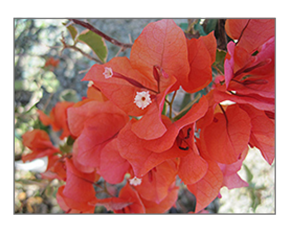
Bambino Baby Sophia Bougainvillea flowers