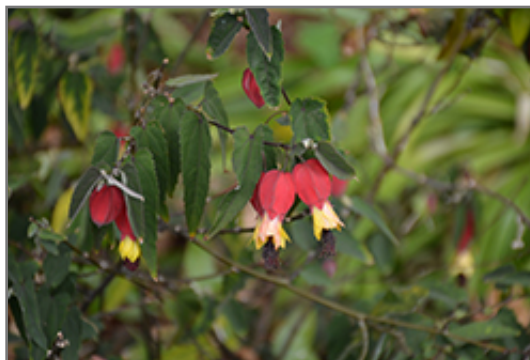
Trailing Abutilon flowers

Trailing Abutilon is recommended for the following landscape applications;