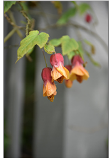
Trailing Abutilon flowers

Trailing Abutilon is a fine choice for the garden, but it is also a good selection for planting in outdoor containers and hanging baskets. Because of its height, it is often used as a 'thriller' in the 'spiller-thriller-filler' container combination; plant it near the center of the pot, surrounded by smaller plants and those that spill over the edges. It is even sizeable enough that it can be grown alone in a suitable container. Note that when growing plants in outdoor containers and baskets, they may require more frequent waterings than they would in the yard or garden.