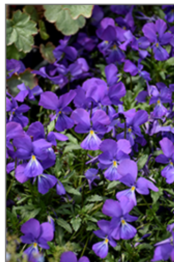
Corsican Pansy flowers

Corsican Pansy is recommended for the following landscape applications;