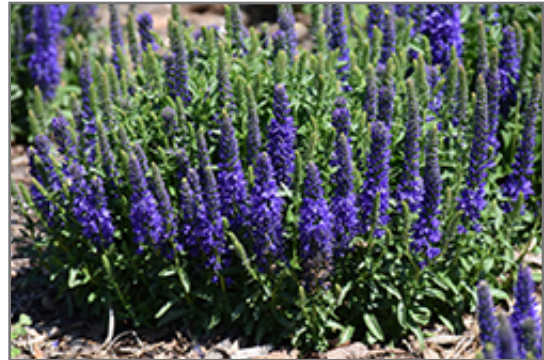
Vespers Blue Speedwell flowers

Vespers Blue Speedwell is recommended for the following landscape applications;