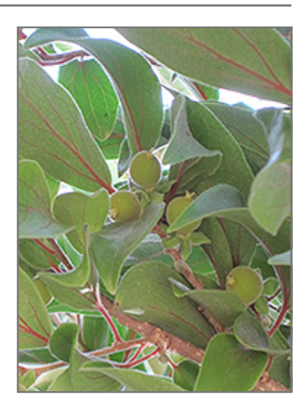
Ceylon Gooseberry fruit

Ceylon Gooseberry has grayish green deciduous foliage on a plant with a spreading habit of growth. The large fuzzy oval leaves do not develop any appreciable fall colour.