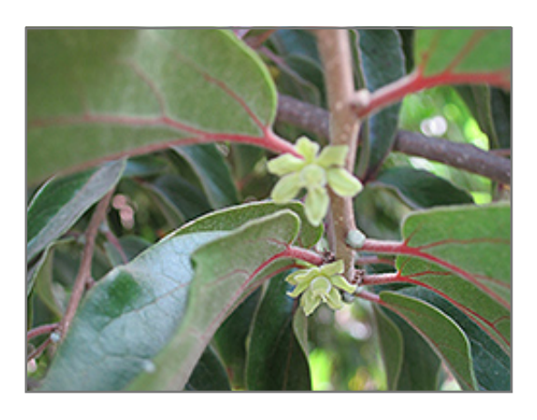
Ceylon Gooseberry flowers